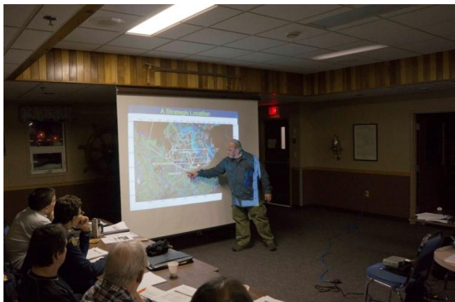
Titigauyaq 6 Donald uniuqtuqta atugakhaliat inikha Ikaluktutiak taphumunga CHARS

Meaghan uniuqtuqta CHARS tapkununga Katimayigalaat unipkaqhugit hunat havagutit ilaa