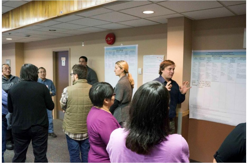
Titigauyaaq 8 Uqauhiginit hugiaqni upalungaiyautit tapkununga pingahut niguqaqtat hivulliutyaqni pityutit

Ilauyut pivikhaqaqtitauyut mikhaani atauhiqmik ikaqnirmik uqauhigininut hugiaqnit upalungaiyautit tapkununga atuni pingahut hivulliutyaqnit piyauyut, talvanga ilagiit katiphaqhutik unniqtuqninut hunanik piyangi ilaitnut tapkuat Katimayigalaat (titigauyaaq 8). Ataani tapkuat akhuqyuminit uqauhiit. Tahapkuat pinahuaqngittut unniqpiaqnit uqauhit, kihimik pinahuat kivgaqtutainut titigaqnit hunat uqauhiuyangi pinahuaqhugit pihimani uqauhiuvalliqtit.