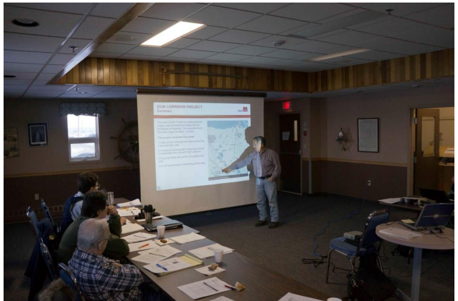
Titigauyaq 3 Donald hatqiqitai tapkununga MMG

Donald pigiaqtuq unipkauhigiplugu tamna Izok Apuqutaa havanguyuq inigiya. Piplugu nunaliqutinut iniaqnia hanninuangani taphuma Nunatsiaq kikligiyanut, MMG-kut havaktai nunaliuyuni uqaqatigiknit pingahuni Inuvialuit nunaliuyuni tapkunani havaguhiqni hivuagut tapkuat SEMC-kut katimaniat. MMG-kut kayuhiyukhautit uqaqatigiknit tamaita Kitikmeotni nunaliuyut talvani havaguhiqmi kinguagut taphuma katimaniup.