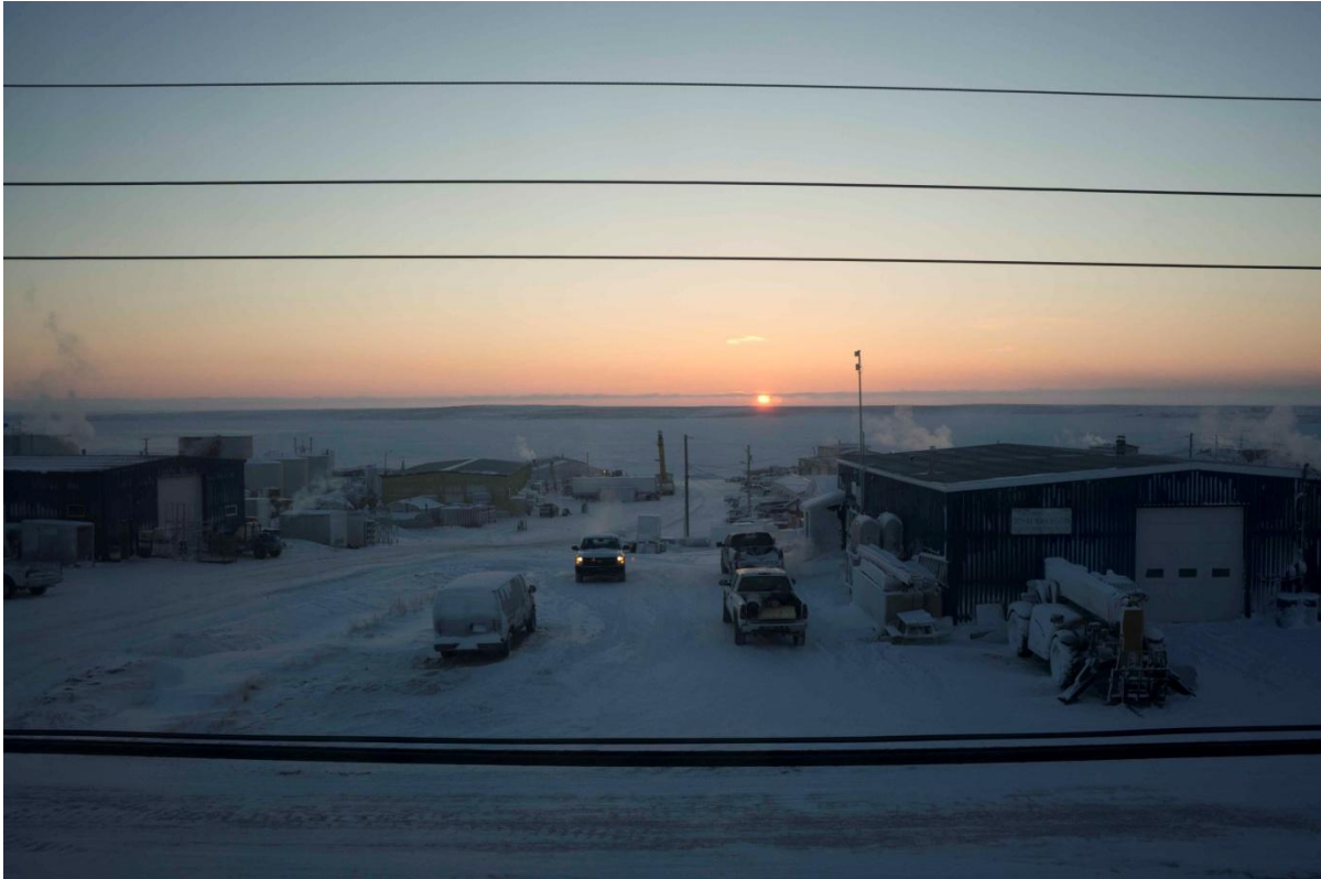
12:30 Unnukkut Hiqingiqnia Ikaluktutiak

Inuliqutit-Maniliugutit Munagininut Katimayigalaat